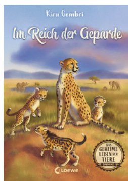
The Secret Life of Animals - Realm of the Cheetahs (Vol. 3, Savannah)