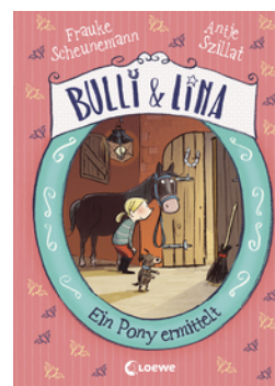
Bulli & Lina - A Pony Investigates (Vol. 4)