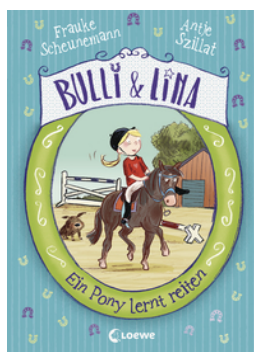
Bulli and Lina - A Pony Learns to Ride (Vol. 2)