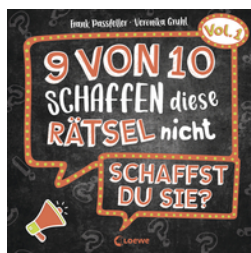
9 out of 10 Can't Solve These Puzzles (Vol. 1)