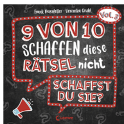
9 out of 10 Can't Solve These Puzzles (Vol. 3)