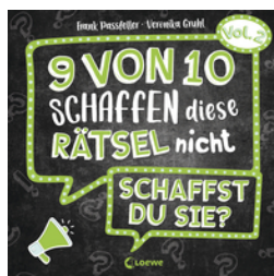
9 out of 10 Can't Solve These Puzzles (Vol. 2)