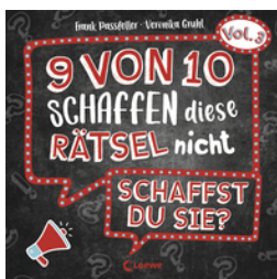
9 out of 10 Can't Solve These Puzzles (Vol. 3)