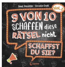
9 out of 10 Can't Solve These Puzzles (Vol. 1)