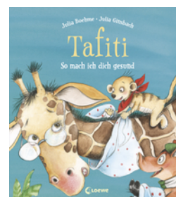
Tafiti – That’s How You Get Well