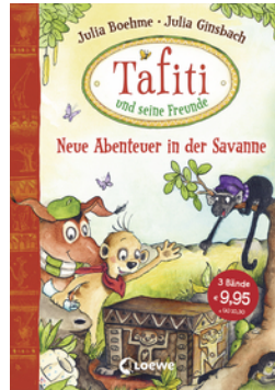
Tafiti and His Friends - New Adventures in the Savannah (Vol. 4-6)