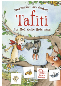
Tafiti – Be Brave, Little Bat!