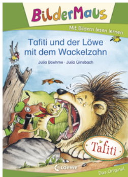
PictureMouse - Tafiti and the Lion with the Wobbly Tooth