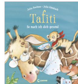
Tafiti – That's How You Get Well