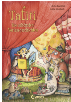
Tafiti – The Best Story Time Adventures for Reading Together