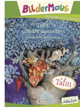
Picture Mouse - Tafiti Sleeps Somewhere Else