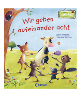
We care for each other!