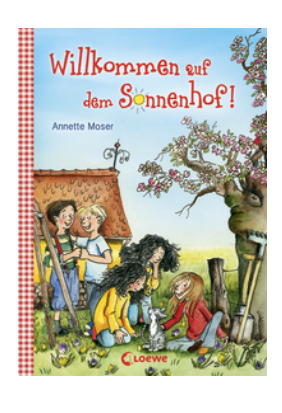
Sunny Farm – Welcome to Sunny Farm! (Vol. 1)