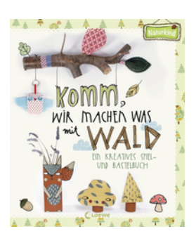
Let's Make Something with Wood