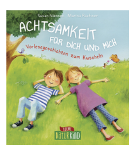
Attentiveness for All of Us! – Story Time is Cuddle Time!