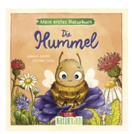
My First Naturebook - The Bumblebee