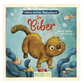
My First Naturebook - The Beaver