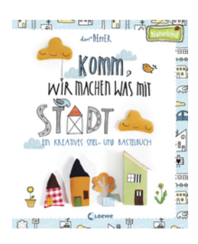
Let's Make Something in Town