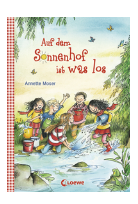
Sunny Farm – Something's up on Sunny Farm (Vol. 3)