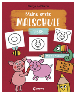
My First Drawing School - Animals