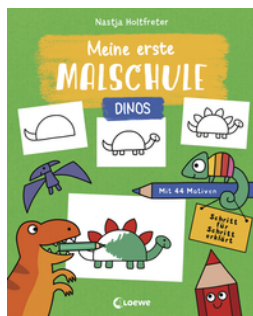
My First Drawing School - Dinos