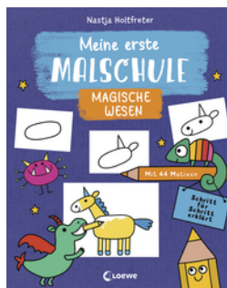
My First Drawing School - Magical Creatures