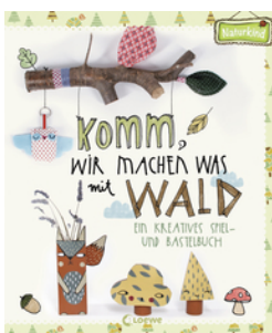
Let's Make Something with Wood