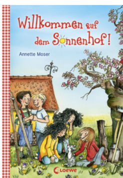
Sunny Farm – Welcome to Sunny Farm! (Vol. 1)