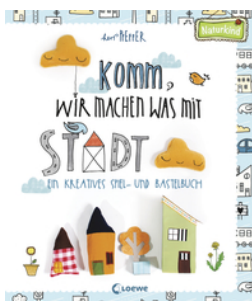
Let's Make Something in Town