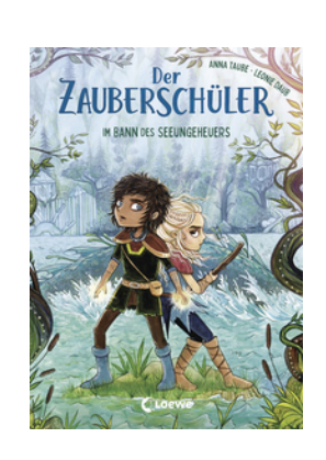
The Sorcerer's Apprentice – Under the Spell of the Sea Monster (Vol. 2)