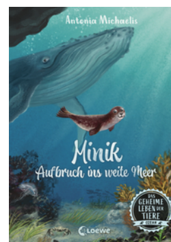
The Secret Life of Animals – Minik's Departure Into the Wide Sea (Ocean, Vol. 1)