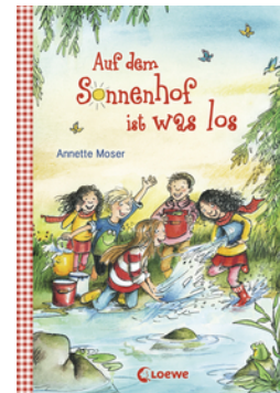
Sunny Farm – Something's up on Sunny Farm (Vol. 3)