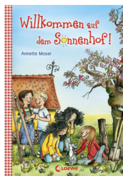
Sunny Farm – Welcome to Sunny Farm! (Vol. 1)