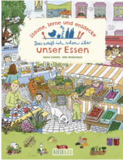
Wonder, Learn and Discover – All I Know About Our Food