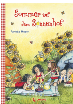
Sunny Farm – Summer on Sunny Farm (Vol. 2)