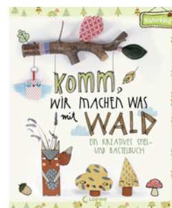
Let's Make Something with Wood