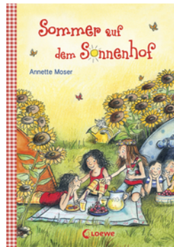
Sunny Farm – Summer on Sunny Farm (Vol. 2)