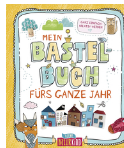
My Craft Book for the Whole Year