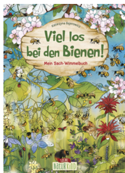
Let's Go Explore the Bees! - My non-fiction Search and Find book