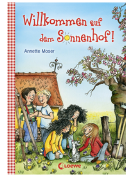
Sunny Farm – Welcome to Sunny Farm! (Vol. 1)