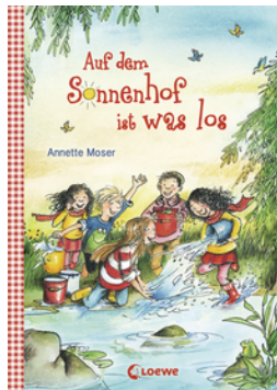
Sunny Farm – Something's up on Sunny Farm (Vol. 3)