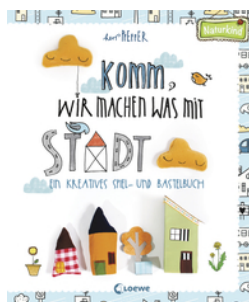
Let's Make Something in Town