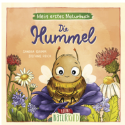
My First Naturebook – The Bumblebee