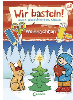
Let's Do Arts & Crafts! - Christmas