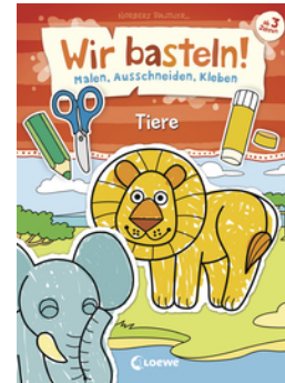
Let's Do Arts and Crafts! - Animals