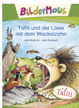
PictureMouse - Tafiti and the Lion with the Wobbly Tooth