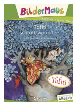
Picture Mouse - Tafiti Sleeps Somewhere Else