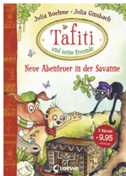
Tafiti and His Friends - New Adventures in the Savannah (Vol. 4-6)