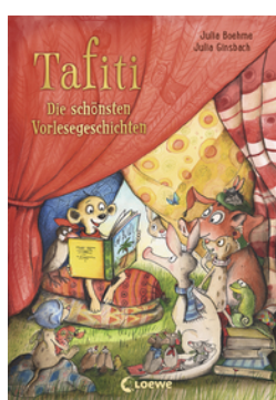
Tafiti – The Best Story Time Adventures for Reading Together