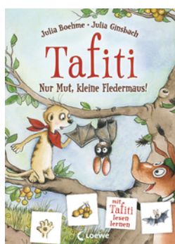
Tafiti – Be Brave, Little Bat!