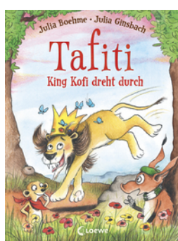
Tafiti – King Kofi Goes Crazy