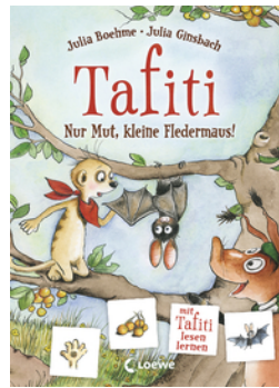
Tafiti – Be Brave, Little Bat!