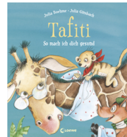
Tafiti – That’s How You Get Well