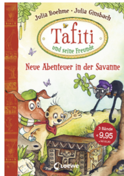
Tafiti and His Friends - New Adventures in the Savannah (Vol. 4-6)