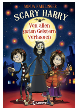
Scary Harry – Takes Leave of his Senses (Vol. 1)