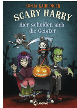
Scary Harry – Strife Among the Spooks (Vol. 5)