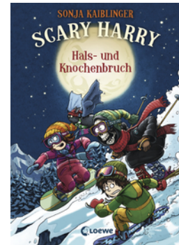
Scary Harry – Break a Legbone (Vol. 6)