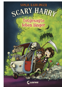
Scary Harry – The Reported Dead Live Longer (Vol. 2)