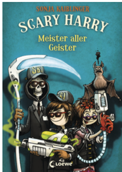
Scary Harry – Master of All Ghosts (Vol. 3)