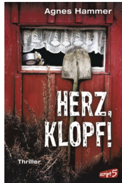
A Beating Heart