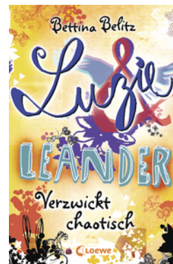
Lucie and Leander – Intricately Chaotic (Vol. 3)