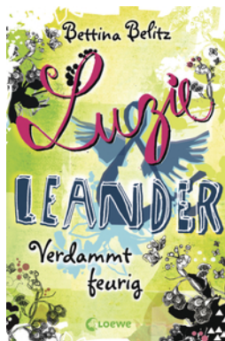
Lucie and Leander – Fierily Damned (Vol. 2)