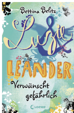
Lucie & Leander – Dangerously Accursed (Vol. 5)