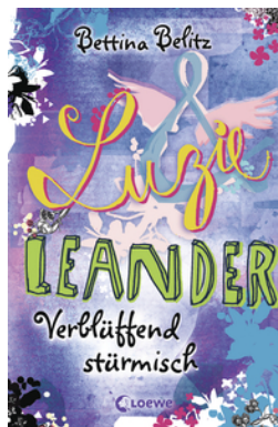
Lucie and Leander – Stunningly Stormy (Vol. 4)