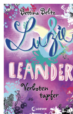
Lucie & Leander - Courageously Wicked (Vol. 6)