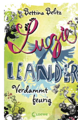
Lucie and Leander – Fierily Damned (Vol. 2)