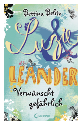
Lucie & Leander – Dangerously Accursed (Vol. 5)