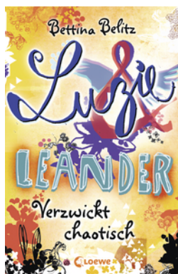
Lucie and Leander – Intricately Chaotic (Vol. 3)