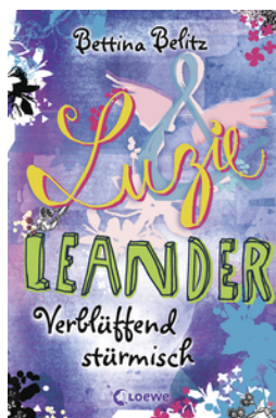
Lucie and Leander – Stunningly Stormy (Vol. 4)