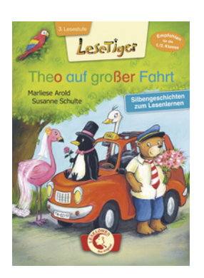
Theo's Big Trip