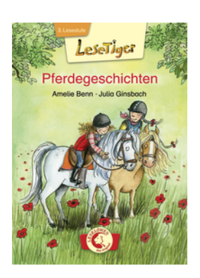
Reading Tiger - Horse Tales