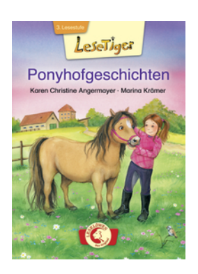
Pony Farm Stories