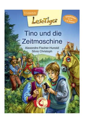
Reading Tiger: Tino and The Time Mashine