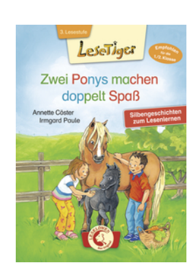
Reading Tiger: Two Ponies are Twice the Fun