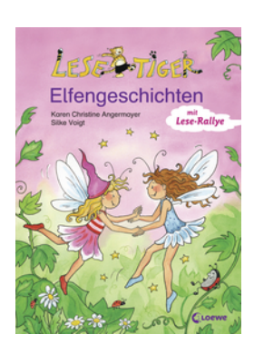
Reading Tiger Fairy Stories