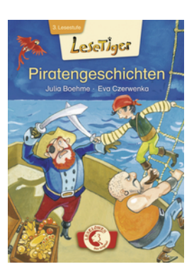
Reading Tiger - Pirate Stories