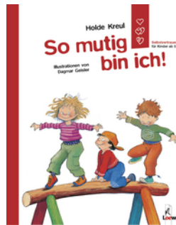
I Can Be Brave - Overcoming Fear, Finding Confidence, and Asserting Yourself