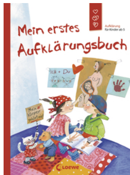
My First Book of Sexual Education