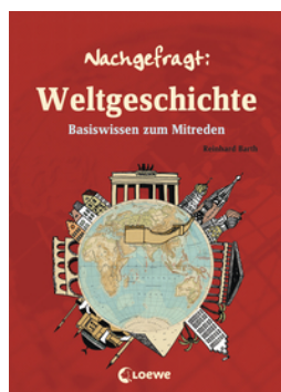
Guide to World History