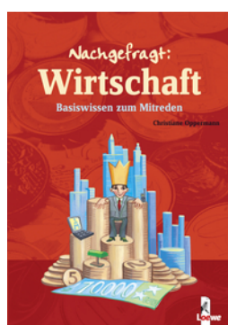
Guide to Economics