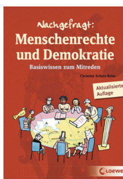
Guide to Human Rights and Democracy