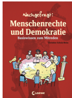
Guide to Human Rights and Democracy