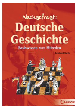
Guide to German History