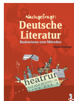
Guide to German Literature