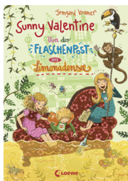
Sunny Valentine – Message in a Bottle in the Lemonade Lake (Vol. 3)