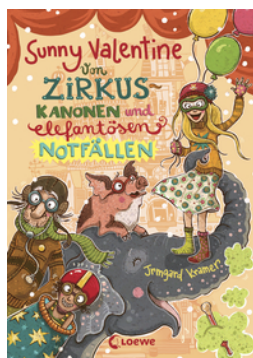
Sunny Valentine – Circus Cannons and Elephantine Emergencies (Vol. 4)