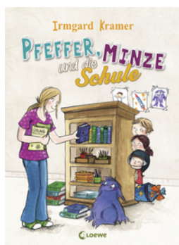
Pepper, Mint and School (Vol. 1)