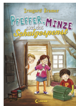
Pepper, Mint and the School Ghost (Vol. 2)