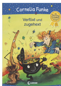
First Reading-Classic - Blessed and Bewitched