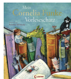
My Cornelia Funke-Reading Treasure