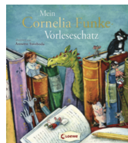
My Cornelia Funke-Reading Treasure