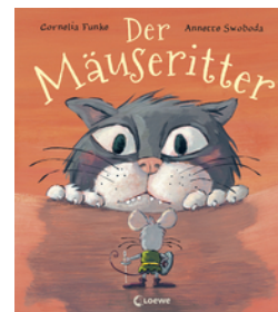
The Mouse Knight