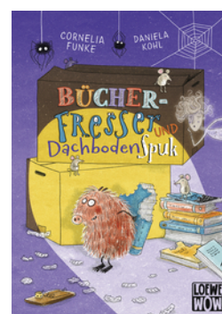
Book Crunchers and Attic Hauntings