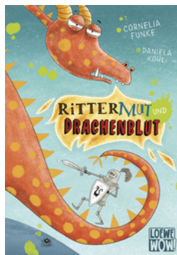
Knighthood and Dragon's Blood