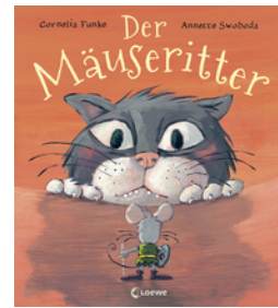
The Mouse Knight