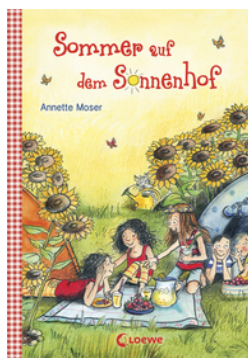
Sunny Farm – Summer on Sunny Farm (Vol. 2)