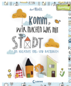
Let's Make Something in Town