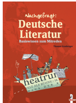
Guide to German Literature