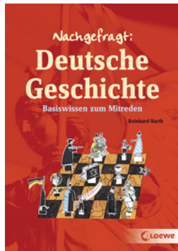
Guide to German History