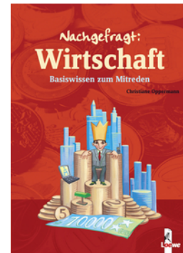
Guide to Economics