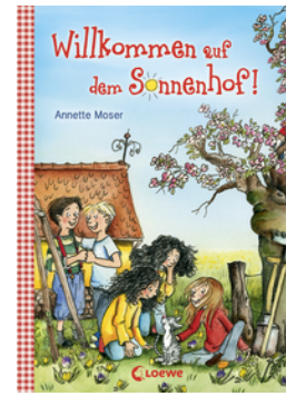
Sunny Farm – Welcome to Sunny Farm! (Vol. 1)