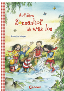
Sunny Farm – Something's up on Sunny Farm (Vol. 3)