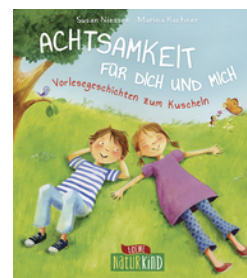
Attentioness for All of Us! – Story Time is Cuddle Time!