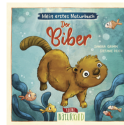
My First Naturebook – The Beaver