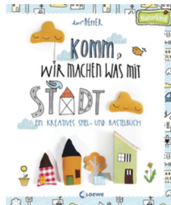
Let's Make Something in Town