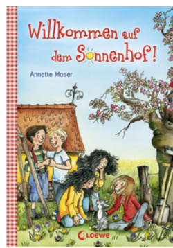
Sunny Farm – Welcome to Sunny Farm! (Vol. 1)