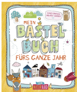
My Craft Book for the Whole Year