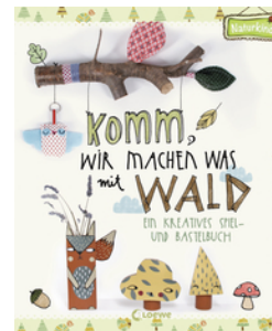
Let's Make Something with Wood