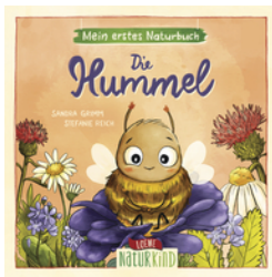
My First Naturebook – The Bumblebee