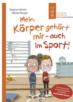
Safe Child, Happy Parent My Body Belongs to Me - Also in Sports!