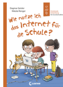
Safe Child, Happy Parent How Do I Use the Internet for School?