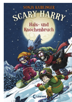
Scary Harry – Break a Legbone (Vol. 6)