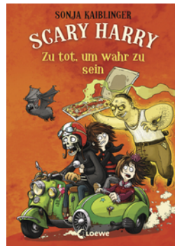
Scary Harry – Too Dead to be True (Vol. 8)