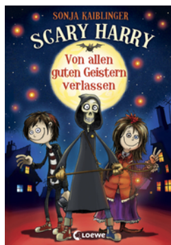
Scary Harry – Takes Leave of his Senses (Vol. 1)