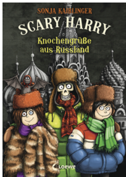
Scary Harry – Bony Greetings from Russia (Vol. 7)