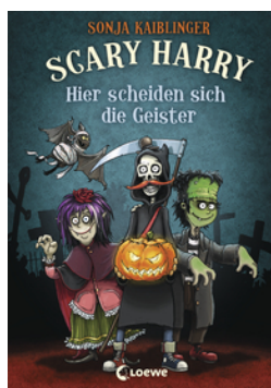
Scary Harry – Strife Among the Spooks (Vol. 5)