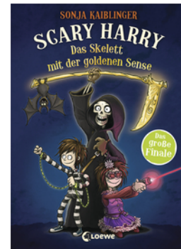
Scary Harry – The Skeleton with the Golden Scythe (Vol. 9)