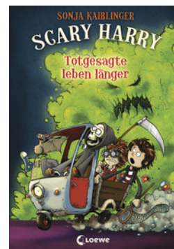
Scary Harry – The Reported Dead Live Longer (Vol. 2)