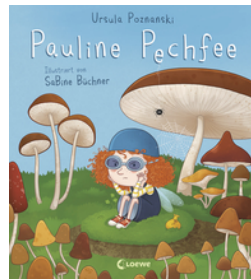
Pauline the Flop-Fairy