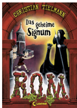
R.O.M. - The Secret Signum (Vol. 2)