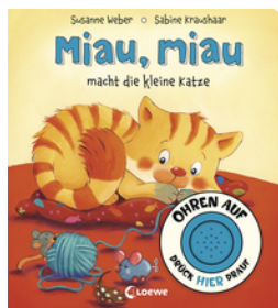
The Cat Says "Meow Meow"