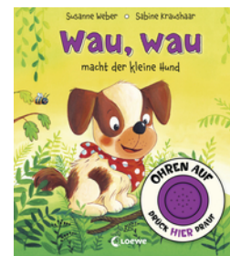
The Dog Says "Woof Woof"