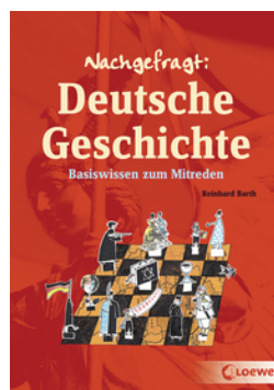
Guide to German History