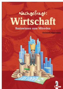
Guide to Economics