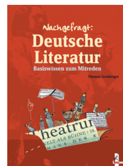
Guide to German Literature