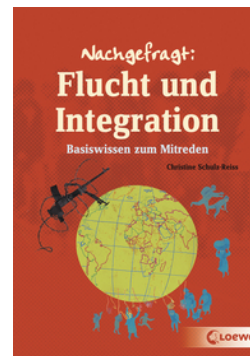
Guide to Refugee Migration and Integration