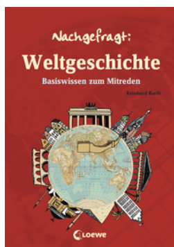
Guide to World History