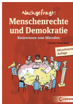
Guide to Human Rights and Democracy