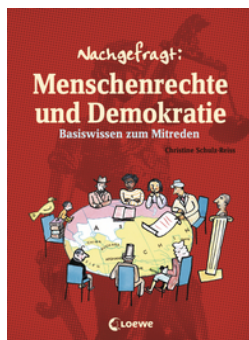
Guide to Human Rights and Democracy