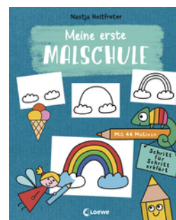
My First Drawing School