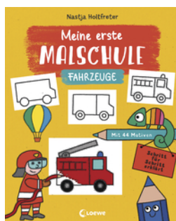
My First Drawing School - Vehicles