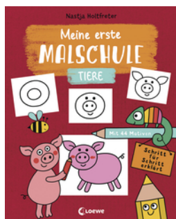
My First Drawing School - Animals