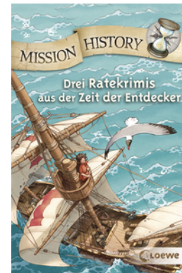
Mission History - Three Detective Stories from the Age of the Explorers