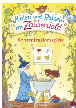
Drawing and Puzzle-solving in the Enchanted Forest - Concentration Games