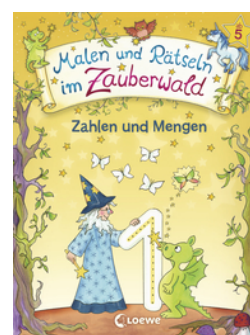
Drawing and Quiz-Solving in the Enchanted Forest - Numbers and Quantities