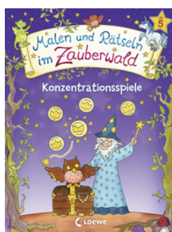
Drawing and Quiz-Solving in the Enchanted Forest - Concentration