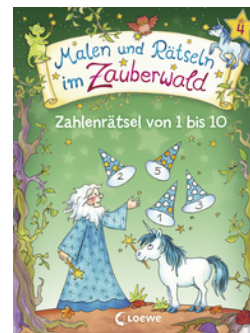
Drawing and Puzzle-solving in the Enchanted Forest - Number Puzzles from 1 to 10