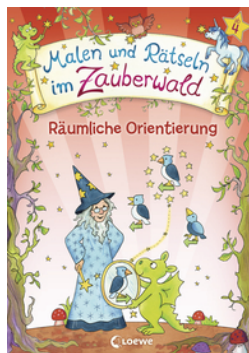
Drawing and Quiz-Solving in the Enchanted Forest - Spatial Orientation