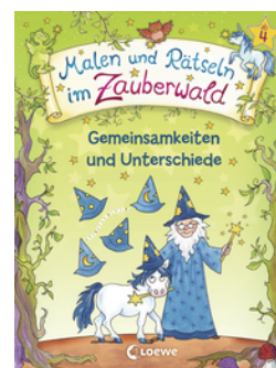
Drawing and Puzzle-solving in the Enchanted Forest - Similarities and Differences