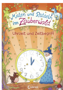
Drawing and Puzzle-solving in the Enchanted Forest - Time