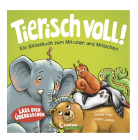
Can You Fit In The Animals?