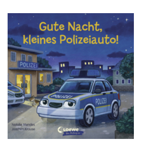
Good Night, Little Police Car!