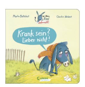
Little Donkey No-Never-Ever -Being Sick