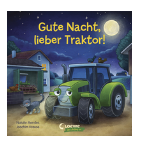
Good Night, Dear Tractor!