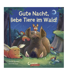
Good Night, Dear Forest Animals!