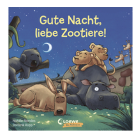
Good Night, Dear Zoo Animals!