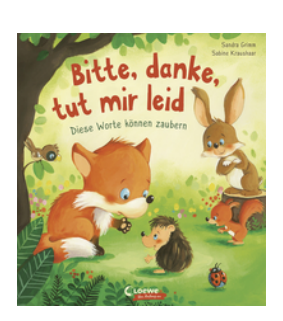
Please, Thank You, I'm Sorry!