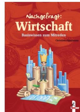
Guide to Economics