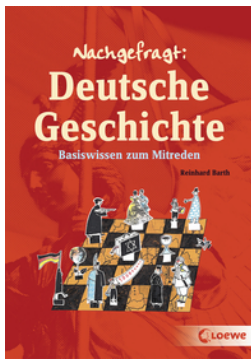
Guide to German History