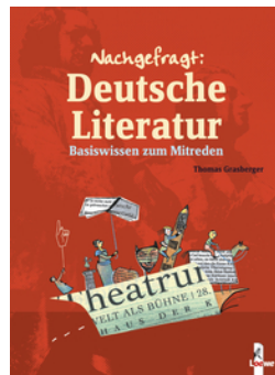
Guide to German Literature