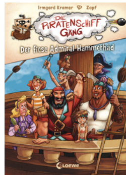
The Pirate Ship Gang – The Abominable Admiral Hammerhead (Vol. 1)