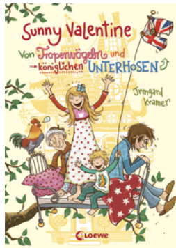
Sunny Valentine – Tropical Birds and Royal Unterpants (Vol. 1)