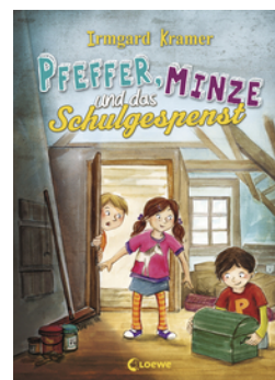
Pepper, Mint and the School Ghost (Vol. 2)