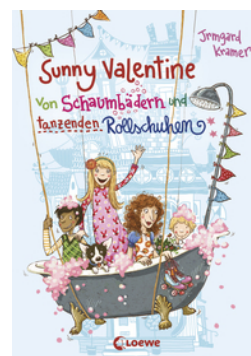
Sunny Valentine – Foam Baths and Dancing Roller-Skates (Vol. 2)