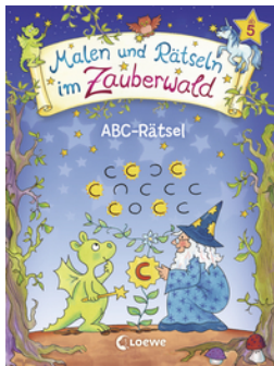
Drawing and Puzzle-solving in the Enchanted Forest - ABC-Quiz