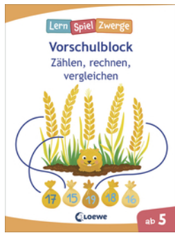
Little Quiz Dwarfs - Counting, Calculating, Comparing