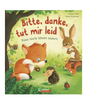
Please, Thank You, I'm Sorry!