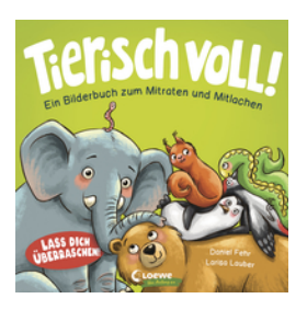
Can You Fit In The Animals?