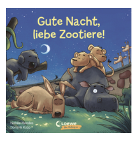
Good Night, Dear Zoo Animals!

E-Mail: <a href="mailto:presse@loewe-verlag.de">presse@loewe-verlag.de</a> <a href="mailto:https://www.loewe-verlag.de">https://www.loewe-verlag.de</a>