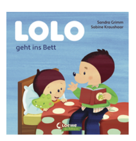
Lolo Goes to Bed