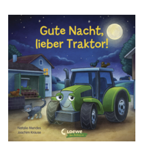
Good Night, Dear Tractor!