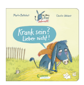
Little Donkey No-Never-Ever -Being Sick