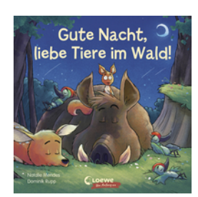
Good Night, Dear Forest Animals!