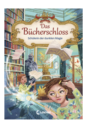
The Enchanted Book Castle (Vol. 6) Student of the Dark Magic