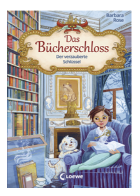
The Enchanted Book Castle (Vol. 2) Charmed Key