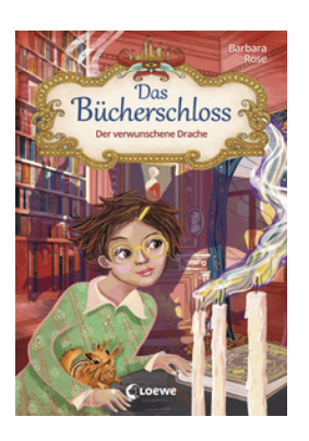
The Enchanted Book Castle (Vol. 7) The Enchanted Dragon