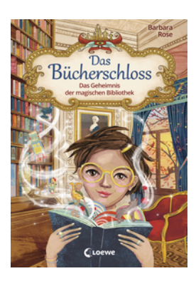
The Enchanted Book Castle (Vol. 1) Secret of the Magic Library