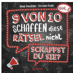
9 out of 10 Can't Solve These Puzzles (Vol. 3)