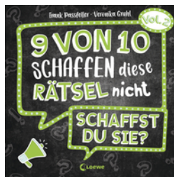
9 out of 10 Can't Solve These Puzzles (Vol. 2)