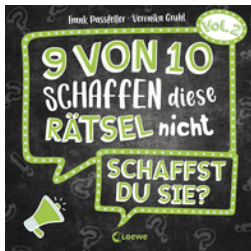
9 out of 10 Can't Solve These Puzzles (Vol. 2)