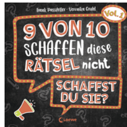
9 out of 10 Can't Solve These Puzzles (Vol. 1)