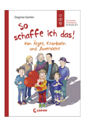
That's How I Can Do It! Of Anger, Being Sick and Confidence