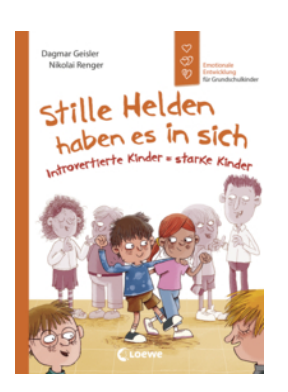
Silent Heroes Have it Within Them - Introverted Kids = Strong Kids