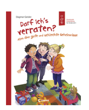
Can I Tell? All About Good and Bad Secrets