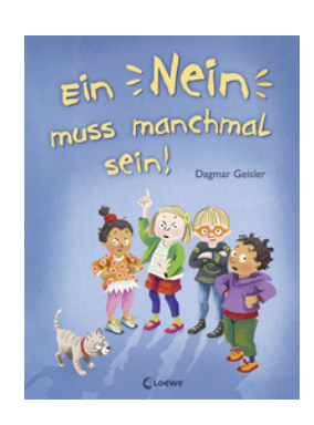
Sometimes a No Has to Be!