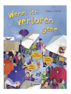
When I Get Lost