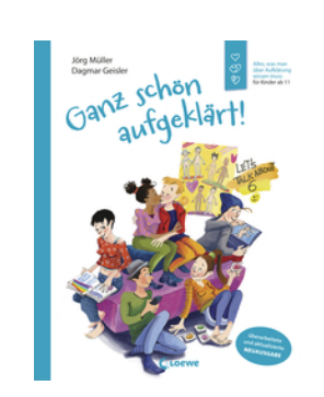
Quite Enlightened! When Boys and Girls Become Men and Women