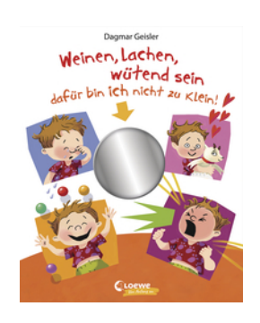
Cry, Laugh, Be Angry I'm not too Small for That!