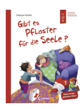
Safe Child, Happy Parent – Are there Plasters for the Soul?