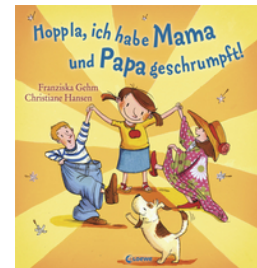
Hey, I've Shrunk Mum and Dad!